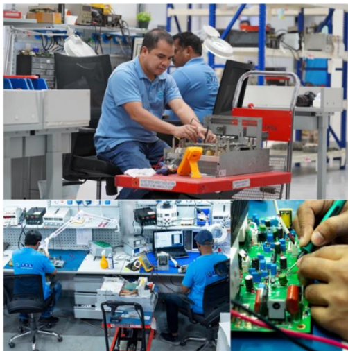
Fig. 1. The facility to remanufacture

The facility will receive many different units and some of those units are similar to Fig 2 which is from sectors like Oil & Gas, Water & Energy. This facility will remanufacture more than 1,000 units a year for the Middle East.